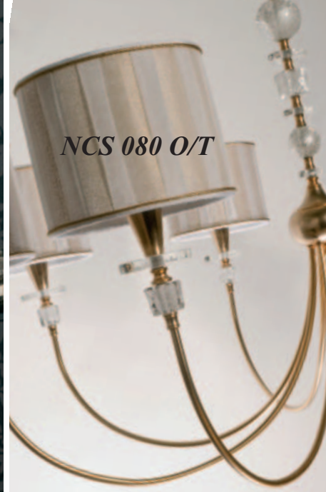
NCS 080 O/T