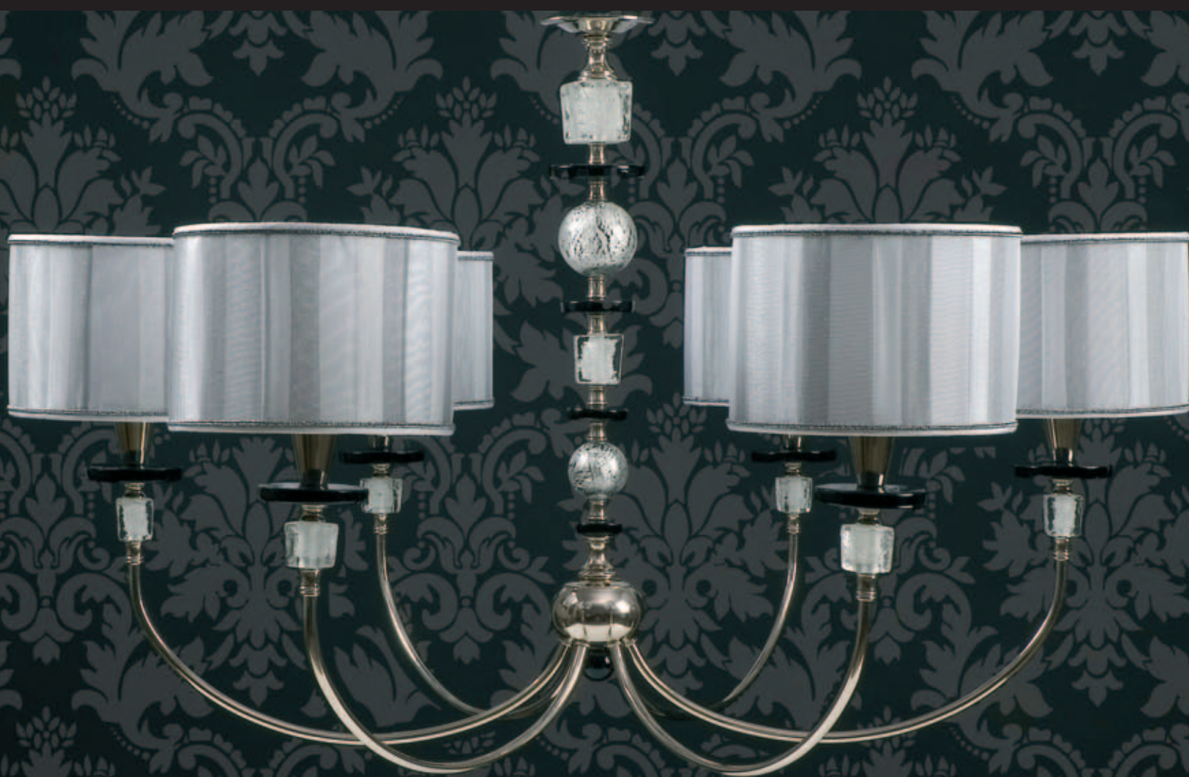
NCS 05 ø cm. 95 - h cm. 66 6 x max 60W - E 27