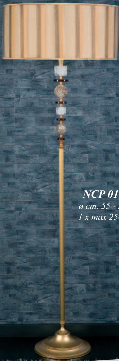
NCP 018 ORO ø cm. 55 - h cm. 175 1 x max 250W - E 27