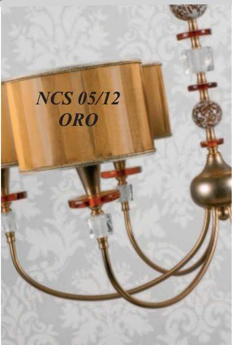
NCS 05/12 ORO