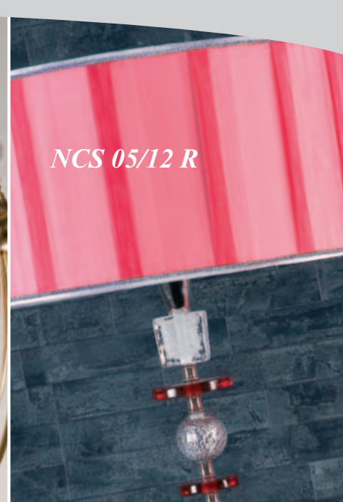
NCS 05/12 R