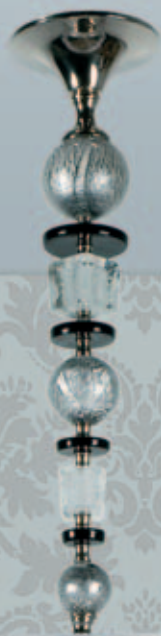
NCS 063 ø cm. 55 - h cm. 90 1 x max 250W - E 27