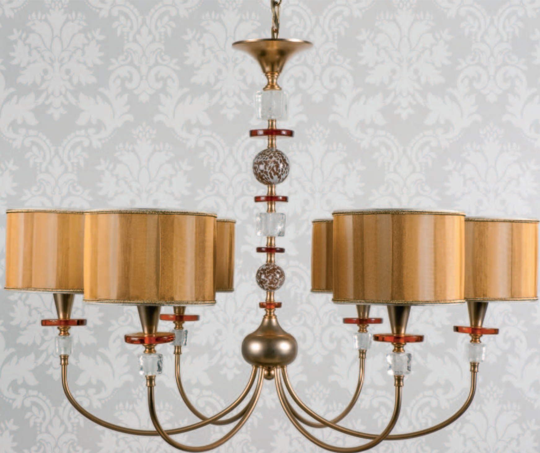
NCS 05 ORO ø cm. 95 - h cm. 66 6 x max 60W - E 27