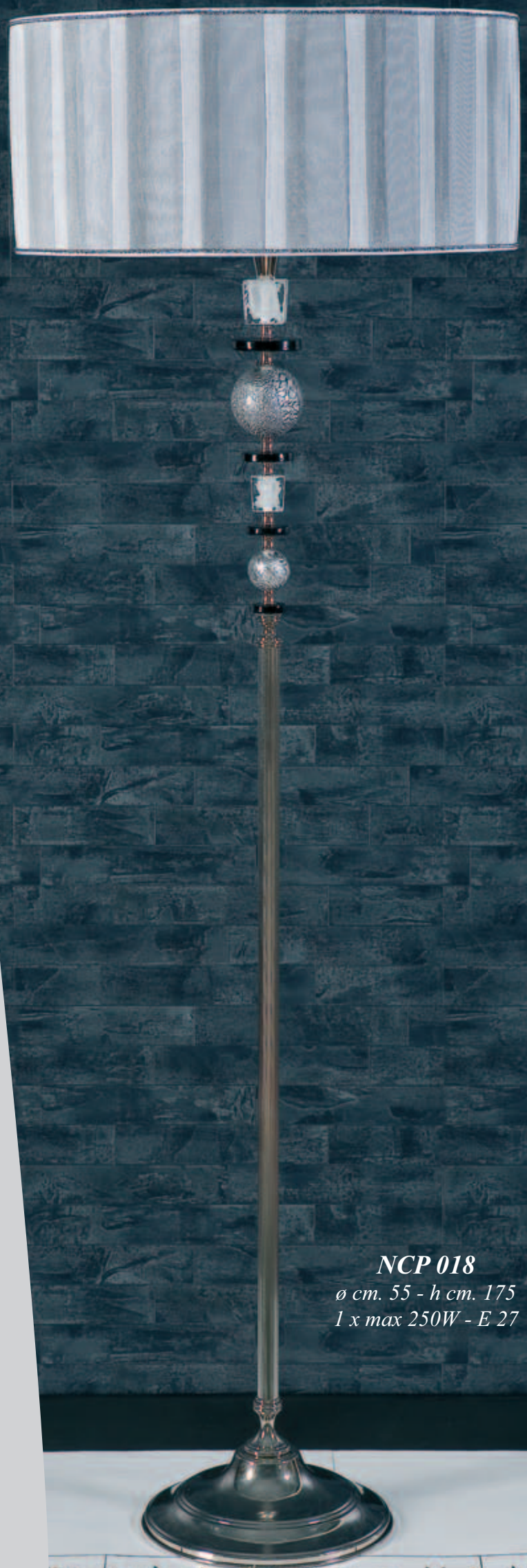
NCP 018 ø cm. 55 - h cm. 175 1 x max 250W - E 27