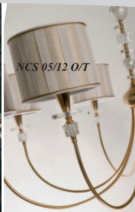
NCS 05/12 O/T