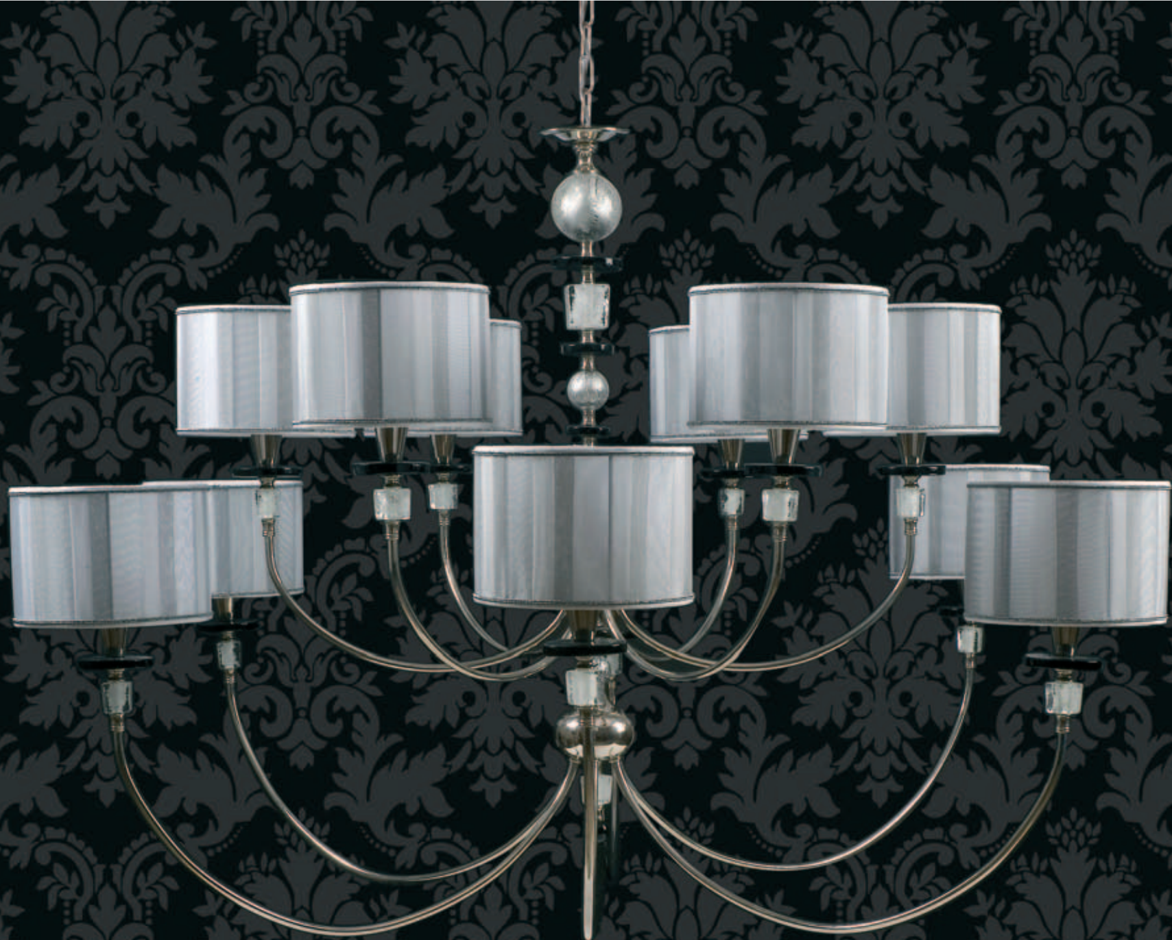
NCS 05/12 ø cm. 130 - h cm. 95 12 x max 60W - E 27