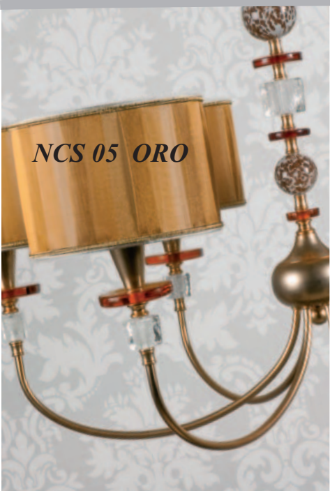
NCS 05 ORO