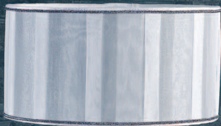
NCL 092 ø cm. 30 - h cm. 54 1 x max 60W - E 27