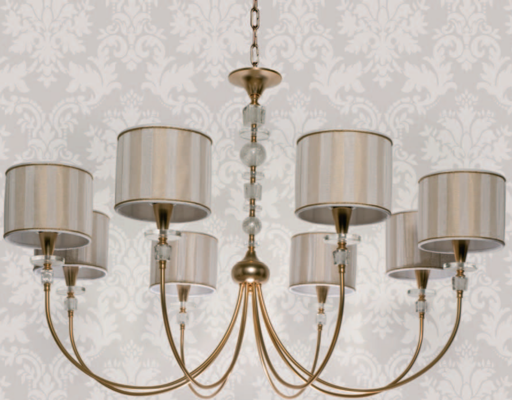
NCS 080 O/T ø cm. 130 - h cm. 95 8 x max 60W - E 27