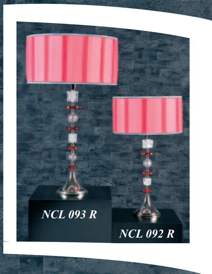
NCL 093 R