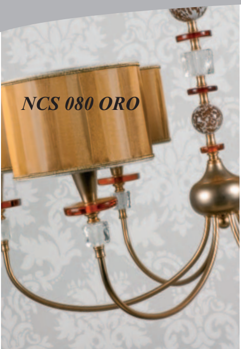
NCS 080 ORO