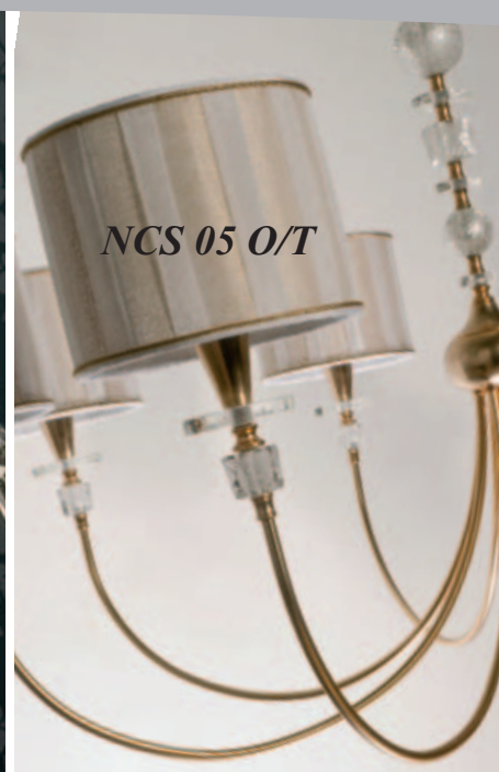
NCS 05 O/T