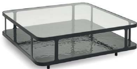
Cascade - designed by Fabrice Berrux

Cocktail table with double trays, structure in lacquered steel, matching colour of bottom tray in marble-like Noir Desir ceramic, and top tray in 8mm-thick natural glass. L.99 x H.35 x D.99cm. European manufacture.