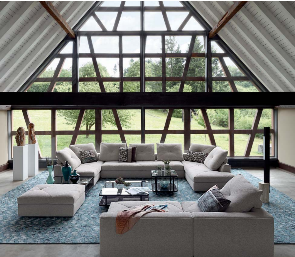
Préface - designed by Studio Roche Bobois Modular sofa entirely removable

Cocktail table with double trays, structure in lacquered steel, matching colour of bottom tray in marble-like Noir Desir ceramic, and top tray in 8mm-thick natural glass. L.99 x H.35 x D.99cm. European manufacture.