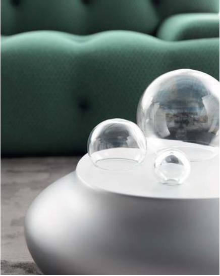
Blogger 3 - designed by Roberto Tapinassi & Maurizio Manzoni Large 3-seat sofa

Cocktail table in polyester resin and glass. Many finishes available. XXS: L.59 x H.23 x D.54cm. XXM: L.100 x H.23 x D.86cm. European manufacture.