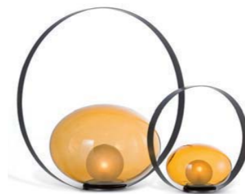
Table lamps in coloured Murano blown glass and ring in steel. L.60 x H.59 x D.37cm. European manufacture.

Scenario. Modular leather composition , L.445/259 x H.85 x D.115cm. Upholstered in Soave leather, rectified pigmented grain. Double-depth backrests with pendulum mechanism, mechanical armrests with lateral opening. Metal base. Other dimensions available. Scenario cocktail tables , designed by Sacha Lakic. Moved half-moon consoles , designed by Sandra Demuth. European manufacture.