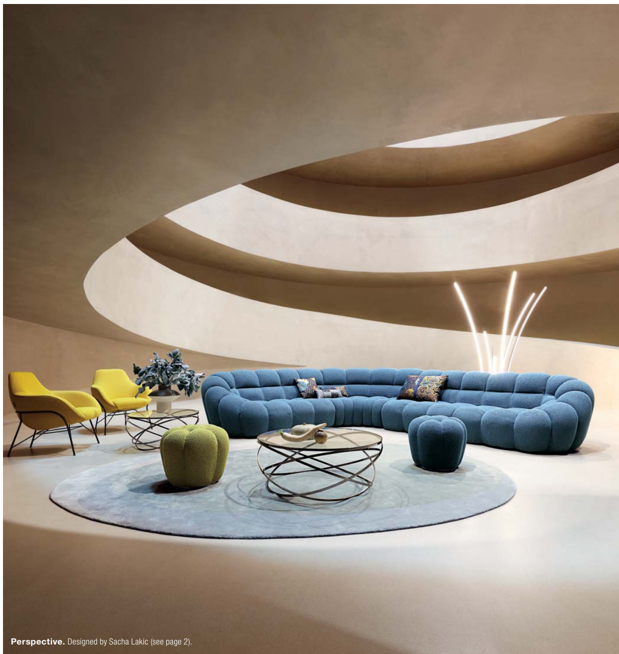
Perspective. Designed by Sacha Lakic (see page 2).