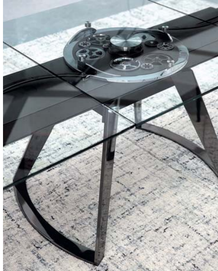
Clockwork mechanism with visible gears remote control and integrated battery.