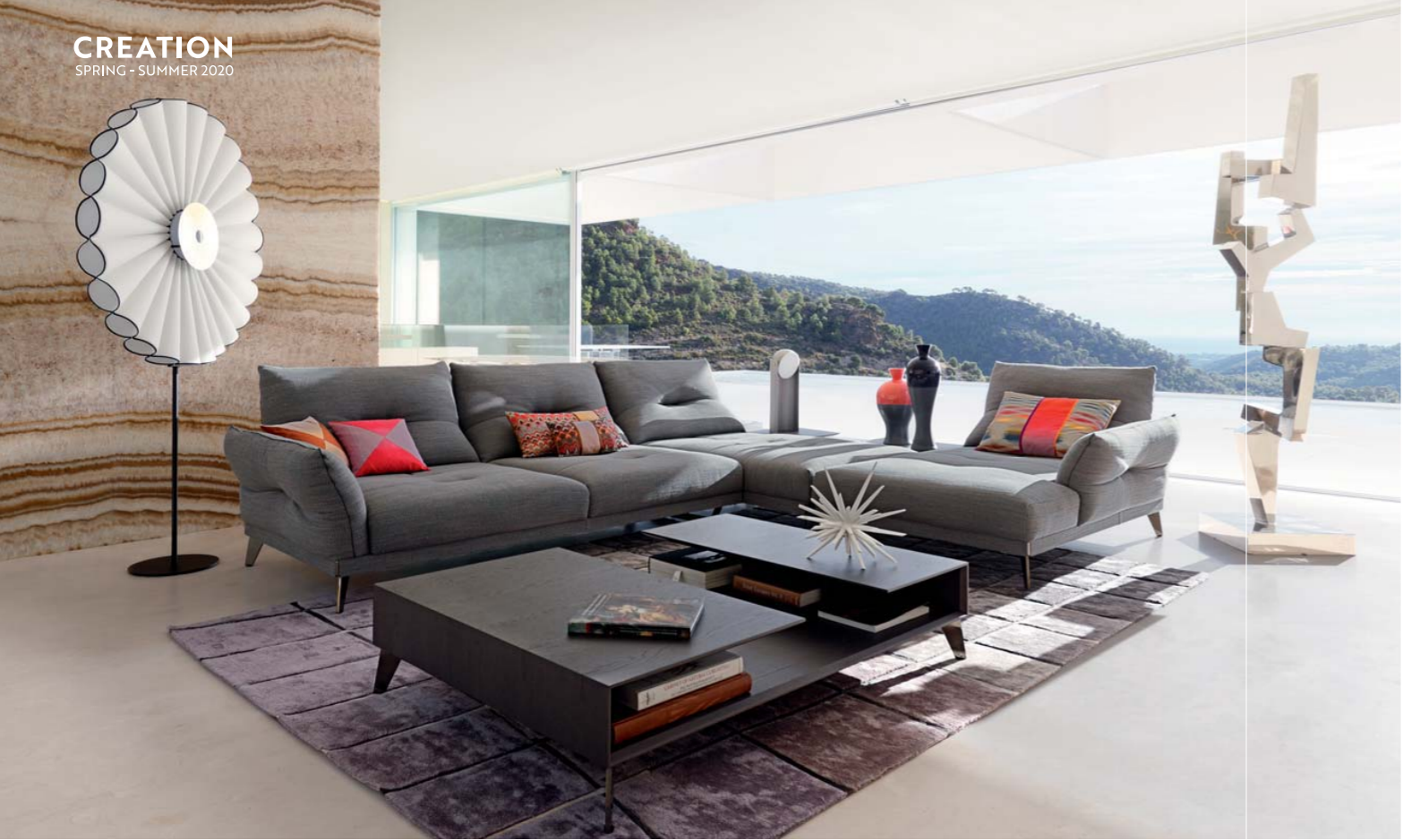
Itinéraire - designed by Philippe Bouix Sofa per elements, double depth backrests

Vase in blown glass and fishes in porcelain. Available in other colours. Ø40 x H.35cm. European manufacture.