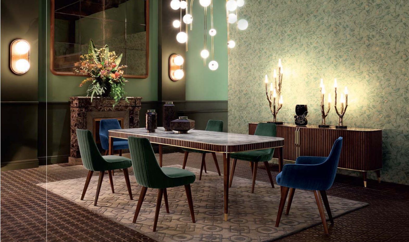
Eden Rock - designed by Sacha Lakic Dining table, Carrara marble top