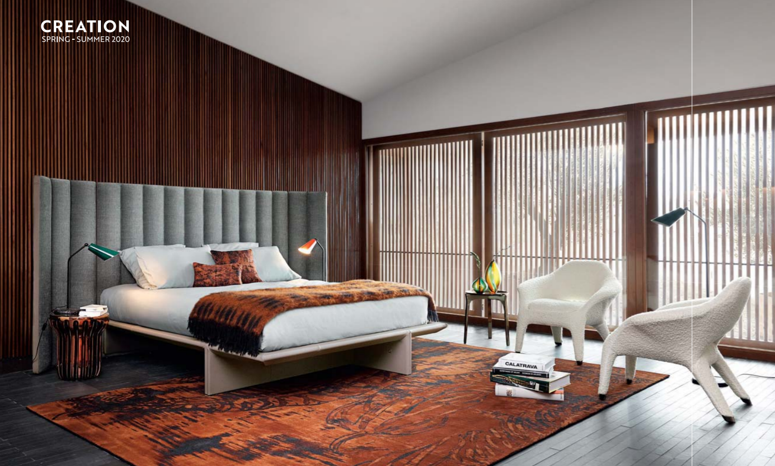
Backstage - designed by Roberto Tapinassi & Maurizio Manzoni Bed, asymmetrical bed frame