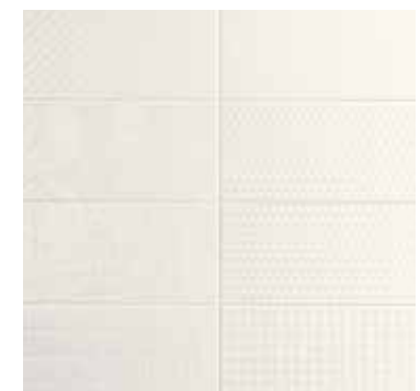
GLOGRA.BI Graffiti Gloss Bianco

*8 grafiche differenti miscelate in scatola *8 various graphics random mixed in a box